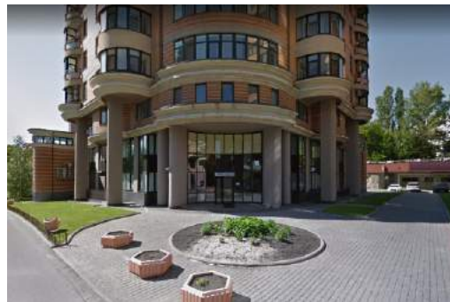
Office in the center of Kiev (Pechersk)